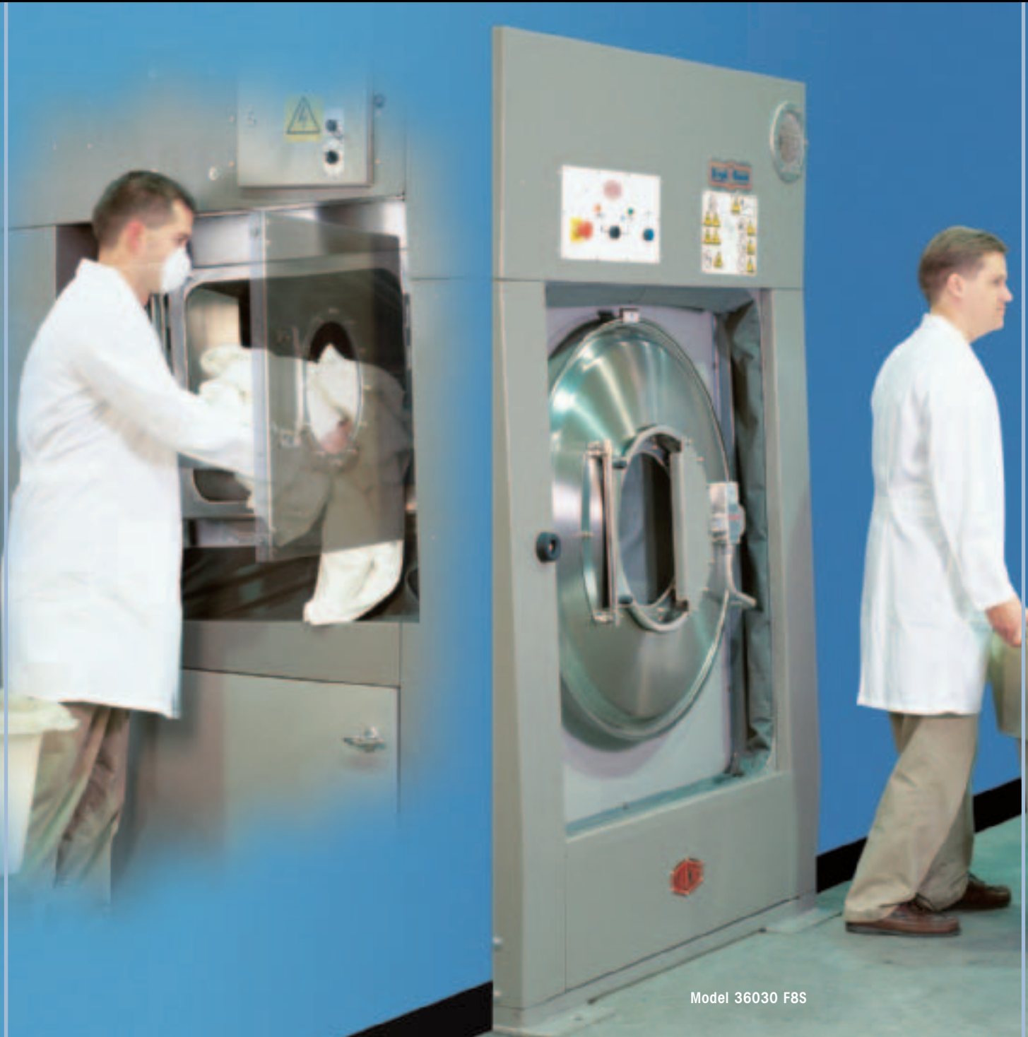
Model 36030 F8S

MORE PRODUCTIVE ▪ HIGH SPEED EXTRACTION ▪ 2 SIZES