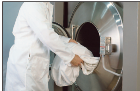
One door for unloading.

These open-pocket Staph-Guard machines conserve valuable floor space , making washrooms more efficient. The minimal footprint makes them ideal where space is limited. Also, machines are available with the loading door on either side of the machine shell . This feature allows flexibility in washroom design and helps to create specific areas in which work traffic is channeled.