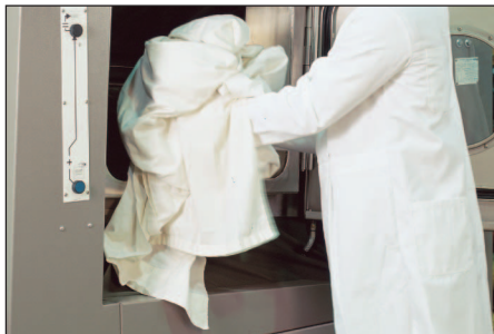
Goods are loaded through a single inner door.

and slides away from the opening for ease of loading. If the door isn't fully closed, it will close automatically when the cylinder begins to spin, helping safeguard against operator error.