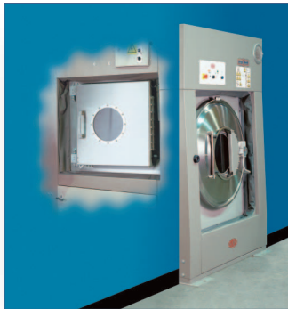
Model 36030 F8S, 110 lbs. (50 kg)