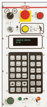
Mark V controller is versatile and user-friendly.

The open-pocket Staph-Guard units use Milnor's proven Mark V controller, which provides up to 100 formulas (98 programmable). Every function of the machine is completely programmable , giving the operator total command over wash functions. Time, water levels, chemical quantities, and cylinder speeds can be easily adjusted for specific goods