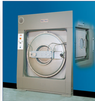
Model 42032 F7R, 165 lbs. (75 kg)