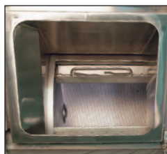
Door opens easily.

A sophisticated inner door design simplifies operation. Thumb-operated levers open the soiled-side inner door, which retracts within the cylinder